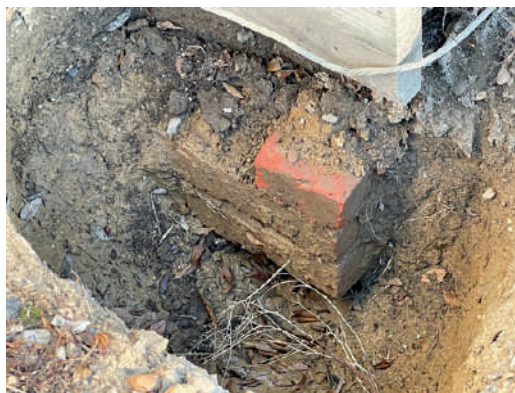
The foundation had crumbled