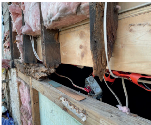
rotted wall framing