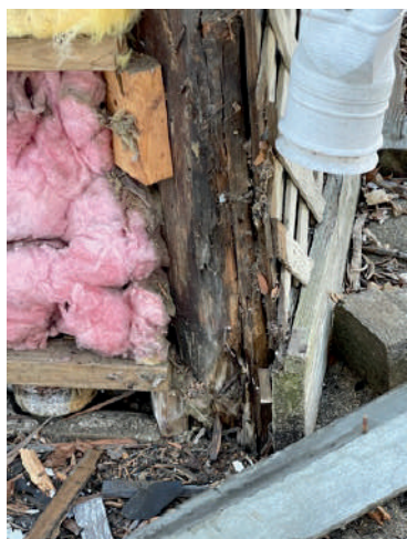
Rotted porch supports