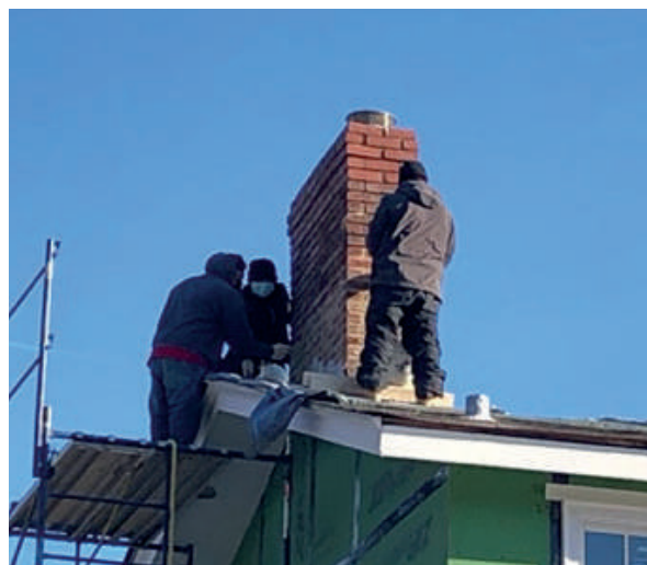
Chimney was ready to collapse