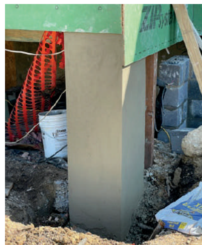
New concrete supports