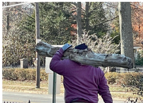
Crew removing rotted porch support