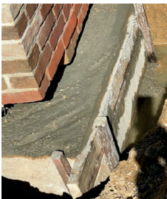
A new foundation poured