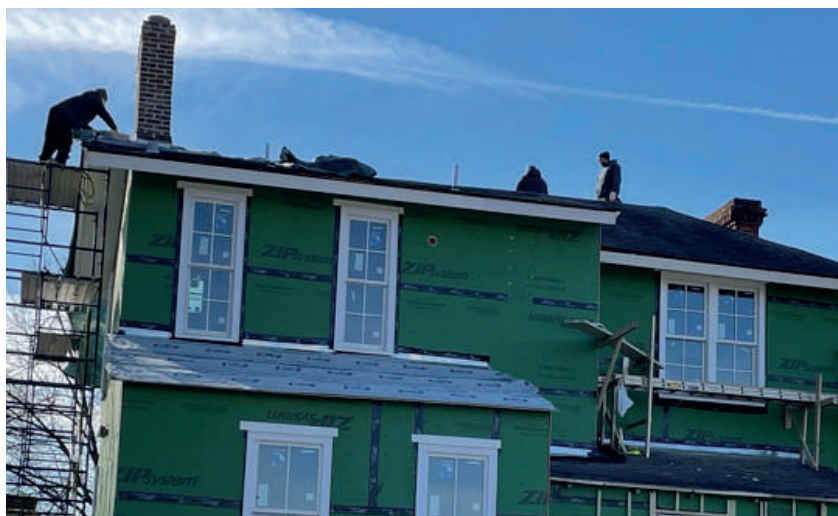
No ridge pole in roof, missing rafter supports