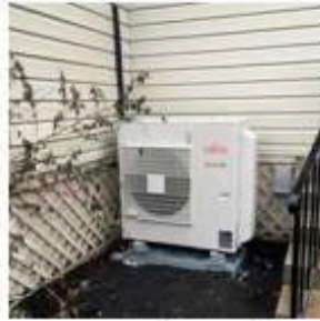
2019: Central air and heat