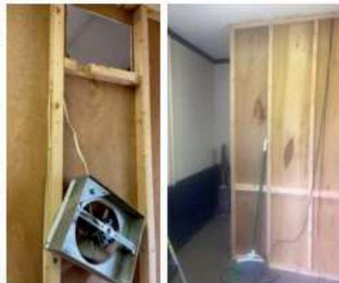
Removal of temporary walls