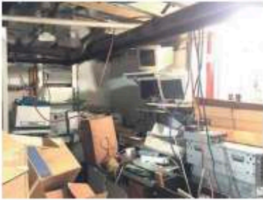
Fall 2017: cleaning out the basement