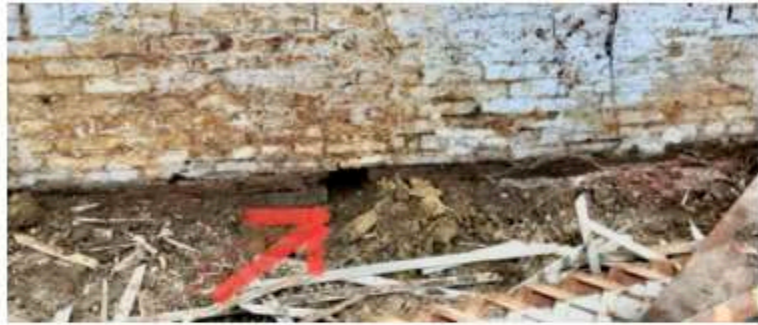
Arrow shows cat sized holes under the foundation.

Step 2 will involve replacing the dilapidated porch and replacing the beautiful and unique windows that were once there. The porch will have a lift, as well as stairs, and a nice outdoor seating area. Come on by for some lemonade!