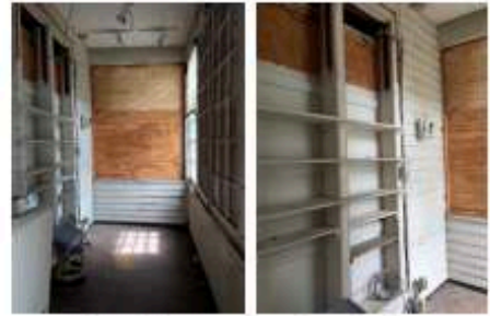
2020 Cleaned out porch, enclosed in the 1970s